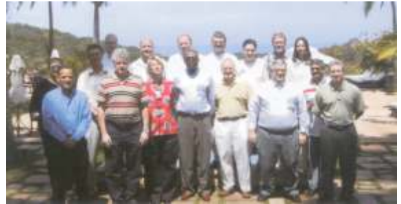
Transportation Fusion Workshop in Durban, South Africa, October 2003

The activities of the GRA have focused on water, energy, transportation, the digital divide and health. The dedication and commitment of the GRA Champions in organising the necessary events and structures for outputs relating to these focus areas have been commendable. The three fusion workshops held on three different continents (Australia for water; Africa for transportation and North America for energy) have delivered valuable outcomes in terms of identified themes where each of these focus areas can make an impact, as well as through the establishment of councils to provide thought leadership and marketing for the relevant capabilities of the GRA. We look forward to workshops in the digital divide and health domains during 2004 as well as ongoing developments in all five focus areas.