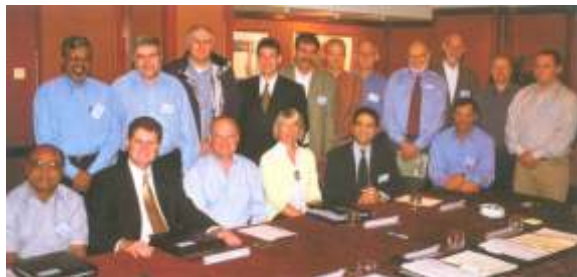
Water Fusion Workshop, Sydney, Australia, March-April 2003

The seminal event of the year must surely be the Delhi Meeting held in January 2003 (hosted by CSIR India) at which the GRA was formally launched. Over this two-day period, representatives of the 'group of nine' reached agreement on the way forward and membership of the Alliance. Summing up the significance of this development, Dr Ramesh Mashelkar noted, "We are joined by our dedication to serving the greater good through innovation and research. Alone, we can each have tremendous impact in the countries we serve. Now, together, we can serve the greater sphere of mankind."