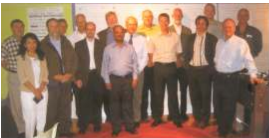
Energy Fusion Workshop in Columbus, Ohio, USA, June 2003