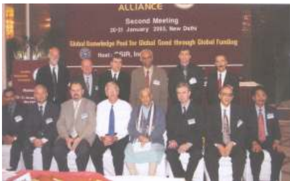
Second Annual Meeting of the Global Research Alliance in Delhi, India, January 2003

It is very heartening to note the scope and the momentum of GRA activities during 2003. An update on the past year confirms the success of our early endeavours so far, which have laid a firm foundation for our next year of operation.